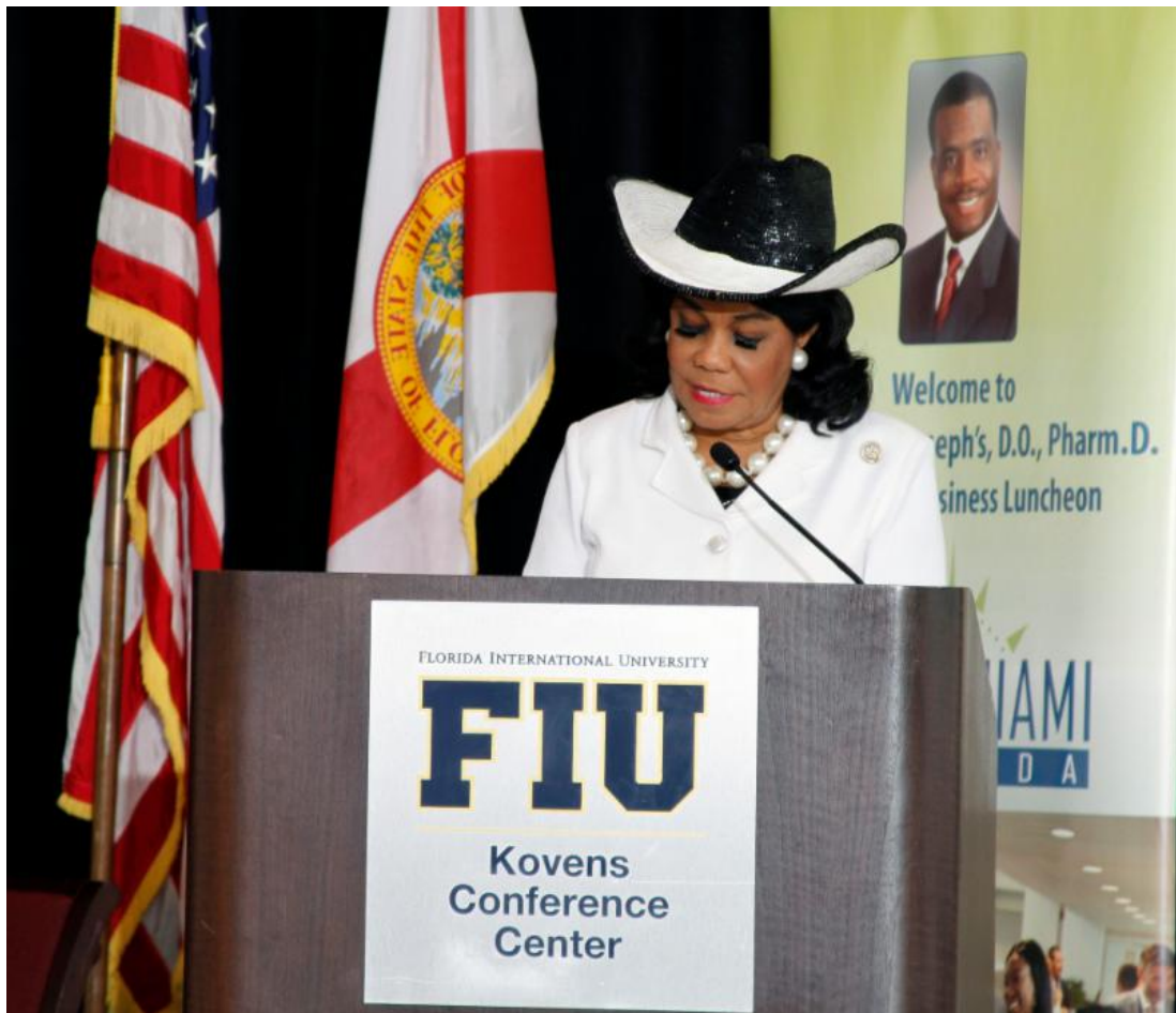
Congresswoman Frederica S. Wilson speaks to the approximately 100 attendees about critical issues affecting Florida's 24th District, which includes the City of North Miami