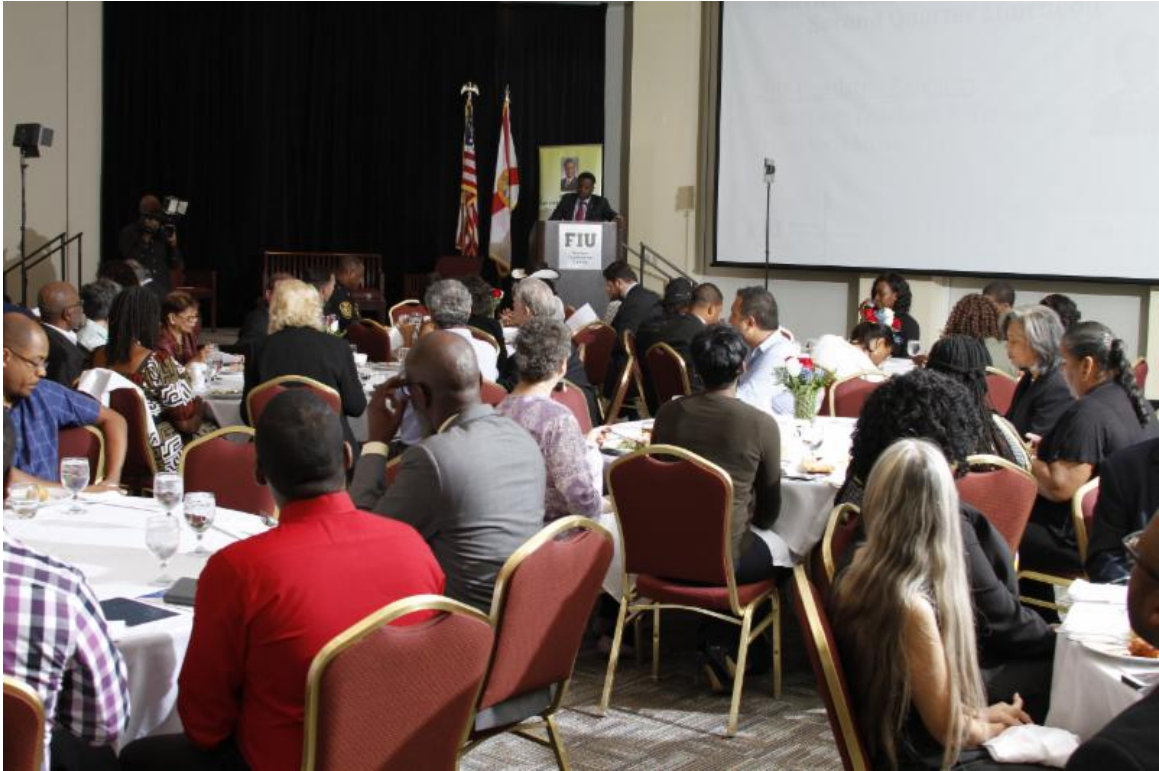
Mayor Smith Joseph addresses the more than 100 attendees at the FIU Kovens Center