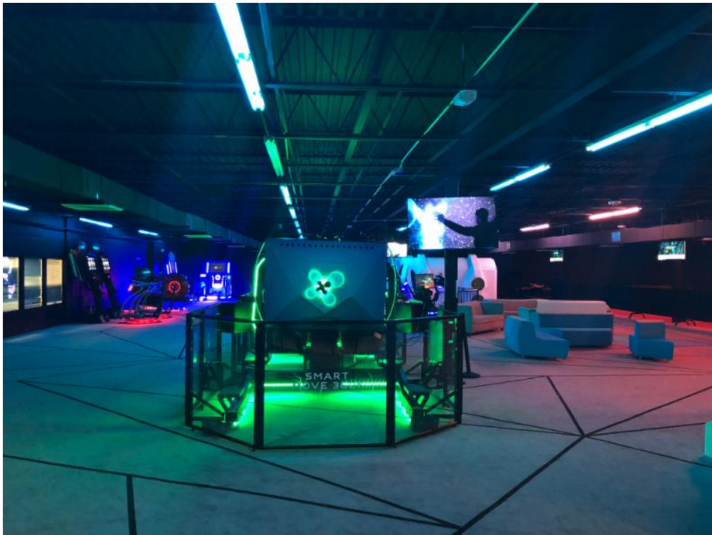
Dezerland's VR Park is a unique and immersive experience with more than 50 virtual reality games

These days the phrase "Live, Work, Play" is heard everywhere to describe the ideal mixed-use development; but at Dezerland Park, the mantra seems to be "Play, Play, and Play." Encompassing more than 250,000 square feet of indoor recreation, Dezerland Park is reinventing itself from a classic automobile museum, into an innovative and diverse indoor entertainment park that will wow just about any visitor.